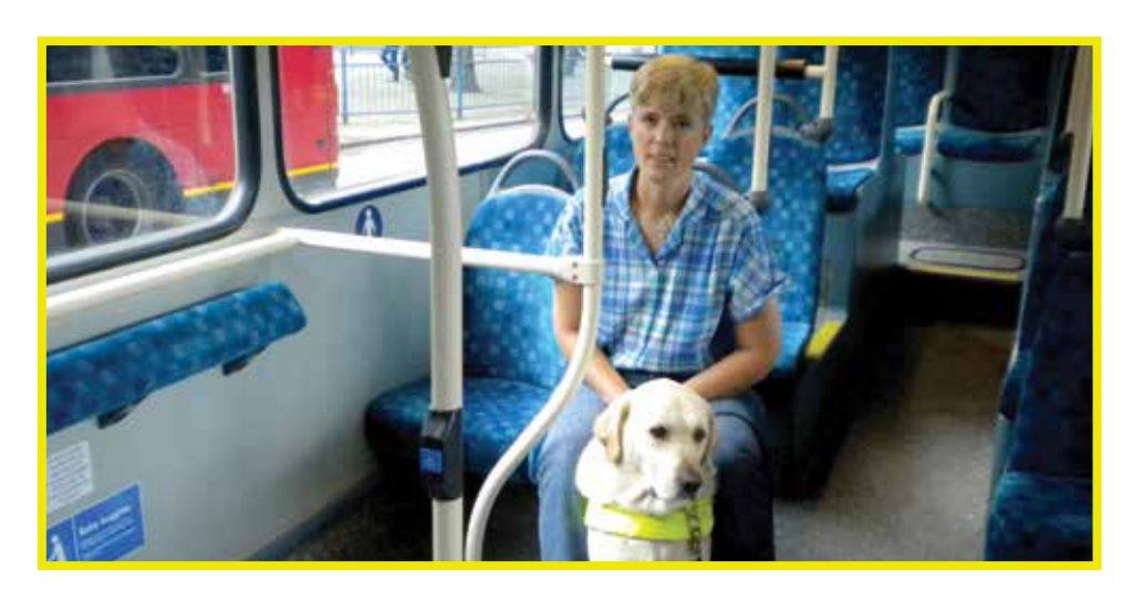
1. Transport Select Committee 'Access to transport for people with disabilities' Report

This shows that many blind and partially sighted passengers are still headed to a Destination Unknown when catching the bus due to a lack of AV and insufficient driver training.